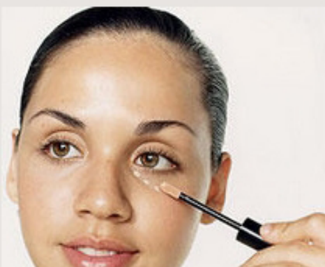
Hide Dark Circles Photo: Almay Clear Complexion Concealer